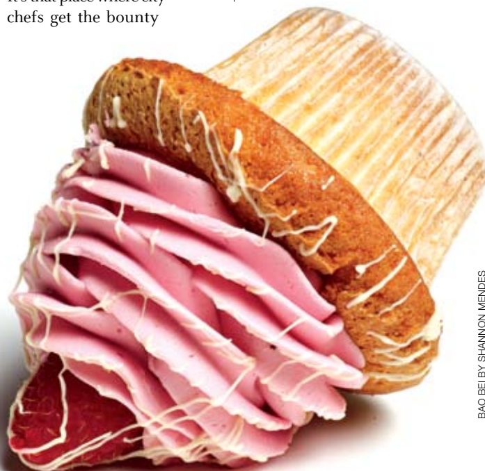
BAO BEI BY SHANNON MENDES

What is it with Calgary and awesome pizza? Most cities